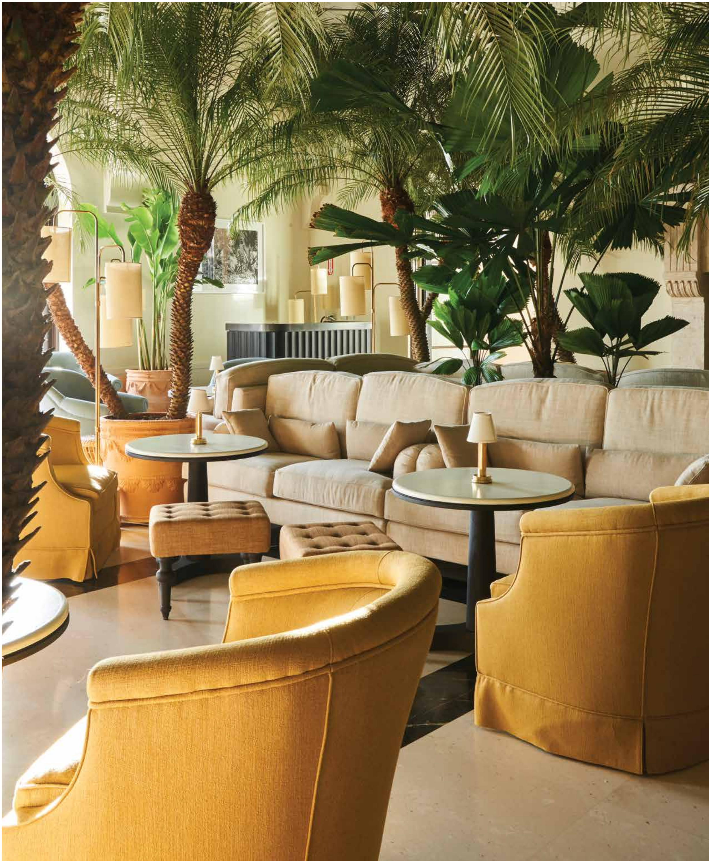
The Champagne Bar