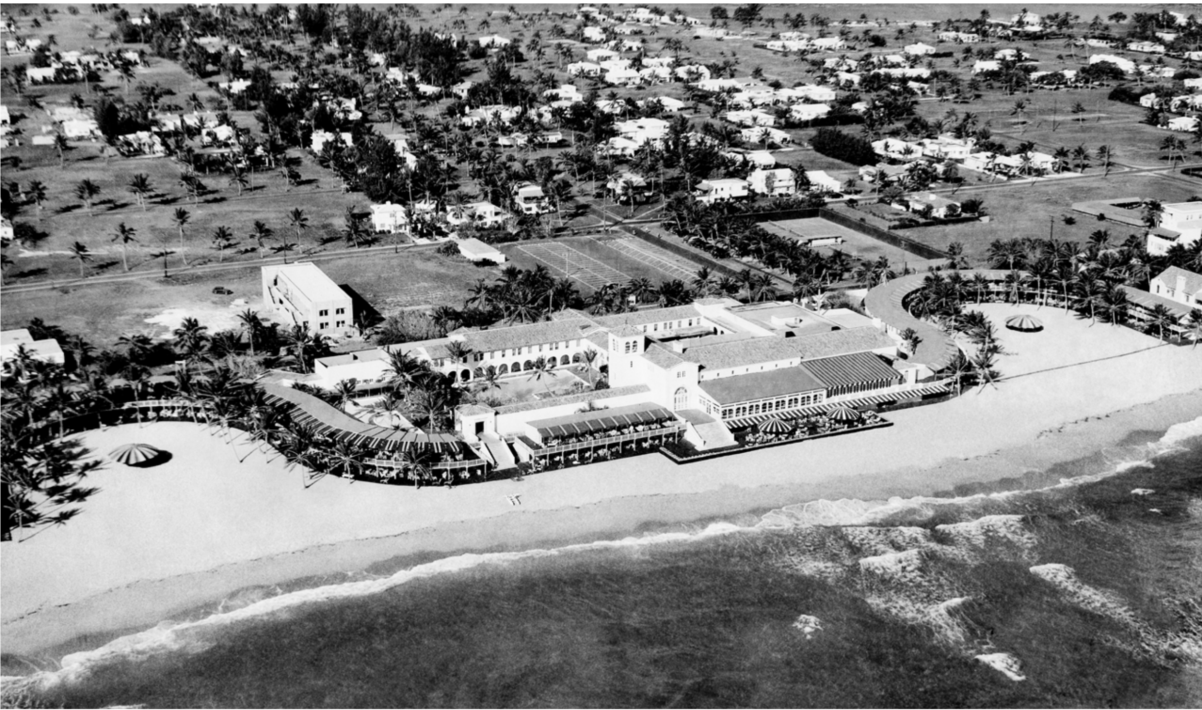
The Surf Club, Surferside, Florida