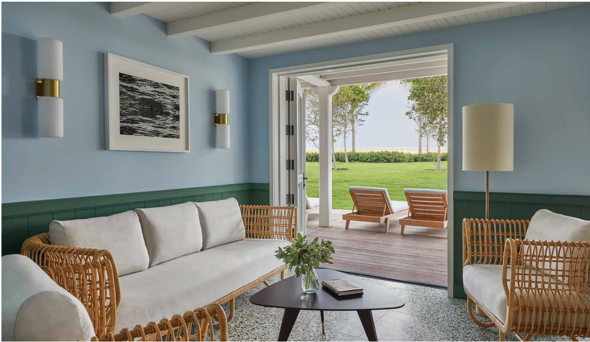
The Cabanas