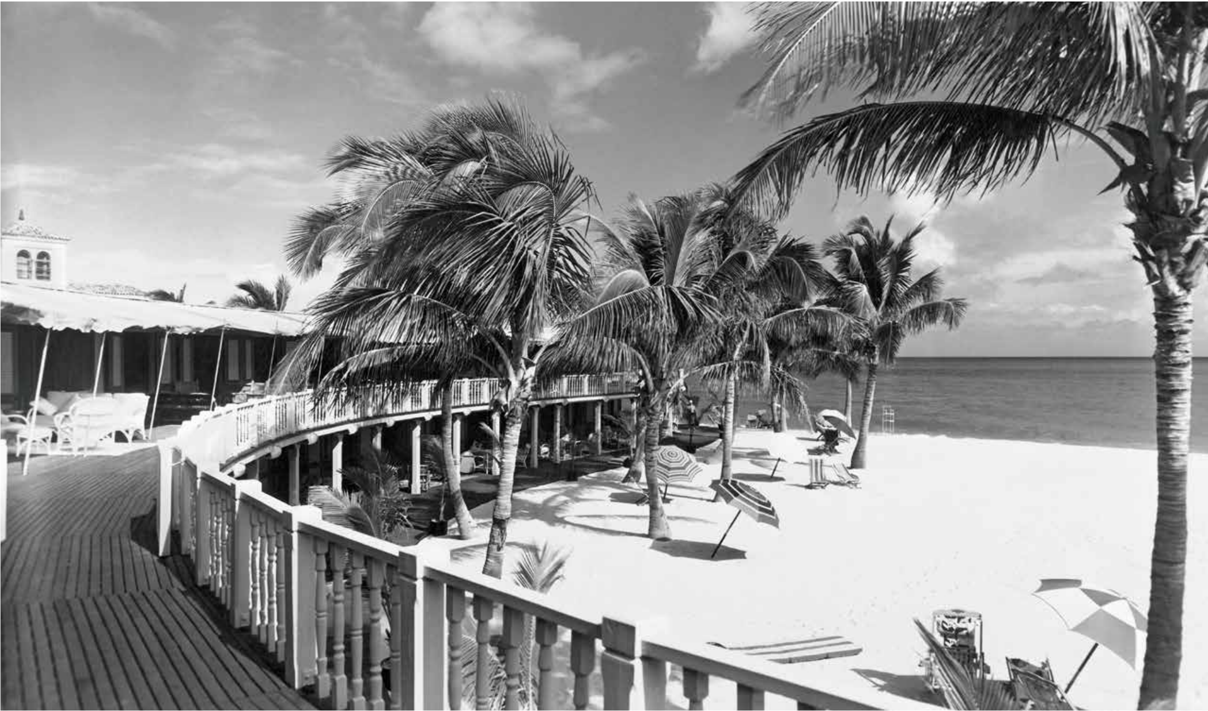
The Surf Club, Surferside, Florida

The Surf Club landscape may have broadened to encompass full-time residences, a proper hotel and a spa, but its raison d'être remains. Within minutes of arrival, you've escaped from reality into the cool reaches of its chic Champagne Bar in the former ballroom, or happened down to the beach cabanas, now rejuvenated in the colors of landscape, sand, sky. Now as then, there is simply no better place to revive seaside memories — or awaken new ones.