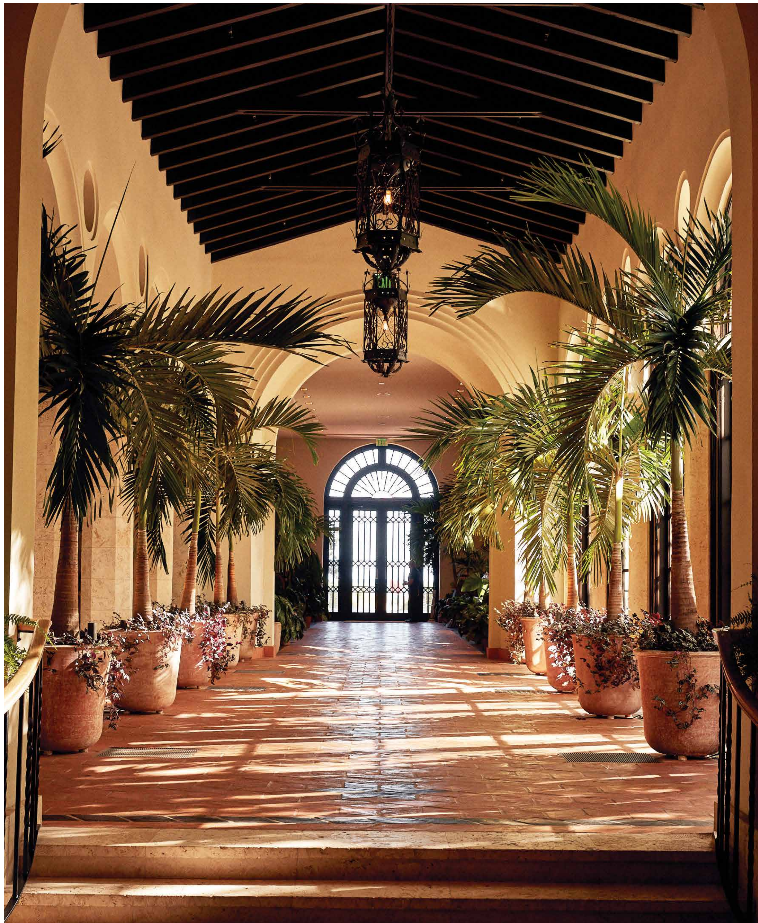
The Surf Club, Surfside, Florida