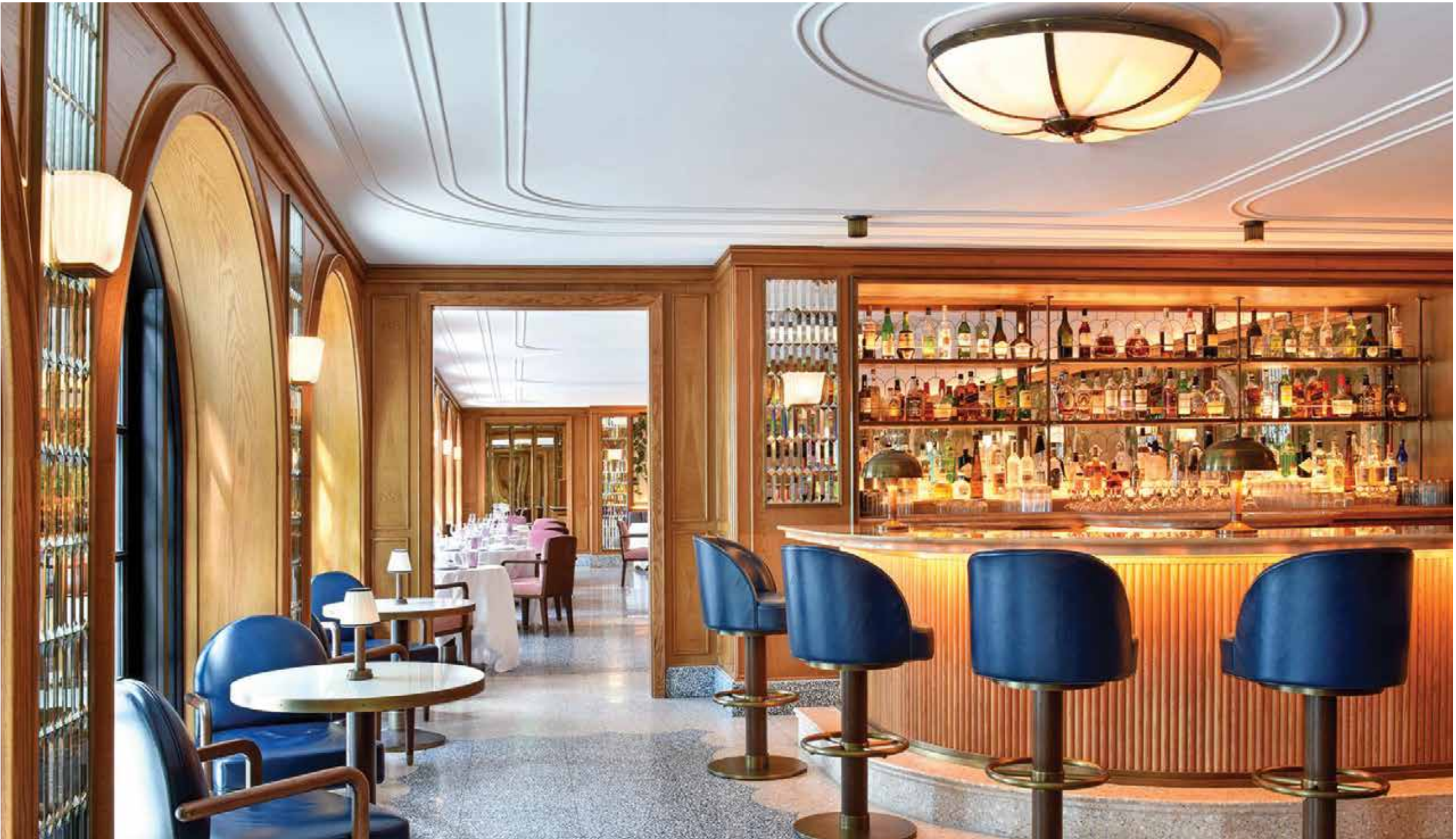
The Surf Club Restaurant