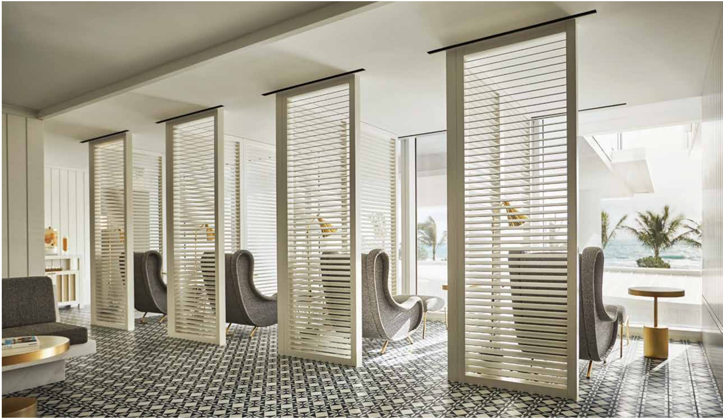
The Spa

Beyond the Surf Club building, a suite of beach cabanas awaits residents for entertaining, dozing or putting watercolor brush to paper, as Winston Churchill enjoyed doing on repeat visits. Cabanas are suffused with details evocative of their Prohibition-era heyday refreshed for contemporary tastes: glittering terrazzo floors in palm-frond green, azure walls, slatted-wood ceilings and louche rattan furniture. The ultimate refuge of all may be The Surf Club Spa, where treatments are performed with the utmost care in crisply tiled treatment rooms that transport you, if the mood strikes, to an idealized modern-day Havana. Or it may be your very own Surf Club Residence. Whichever you choose.